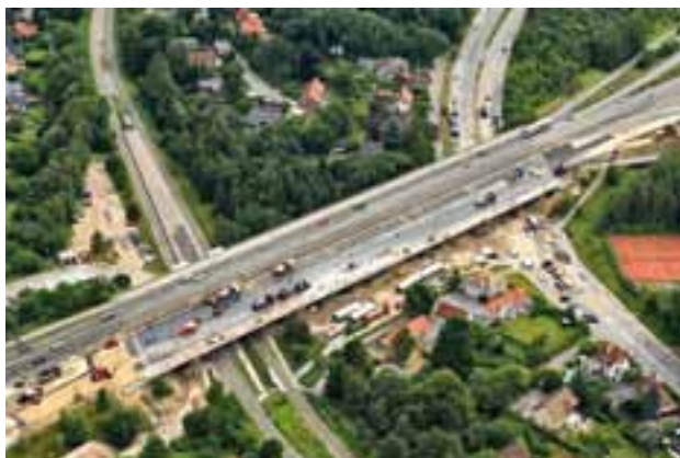
Skovbrynet Highway Bridge Project, Greater Copenhagen

A range of financial conditions relating to a fulfilment of the consolidated operating and cash flow budget in the agreed term are tied to parts of the bank agreement.